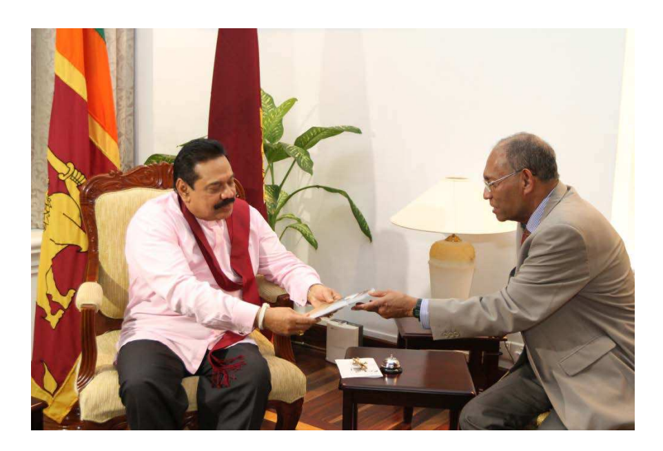
Discussions about the Polonnaruwa meteorite