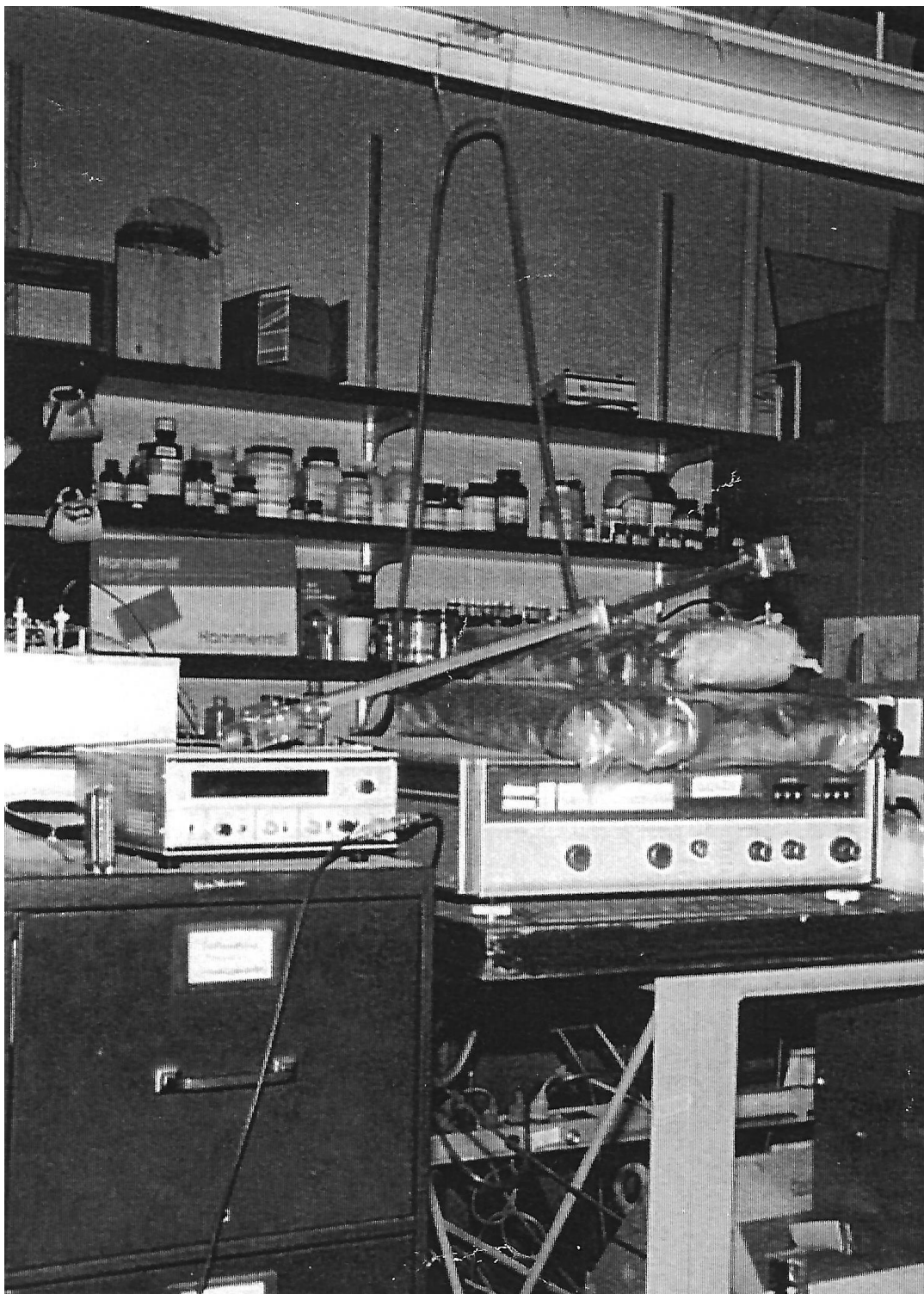
LEFT SIDE OF APPARATUS ABOVE WORK BENCH